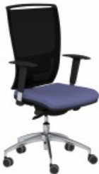
OZ Series High Backrest Swivel Mesh Chair, Vario Adjustable Arms