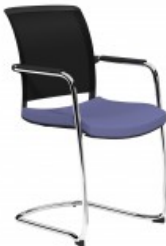
OZ Series Guest Chair